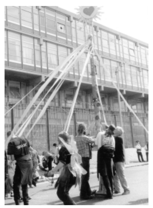
Maypole, 13th May 2000