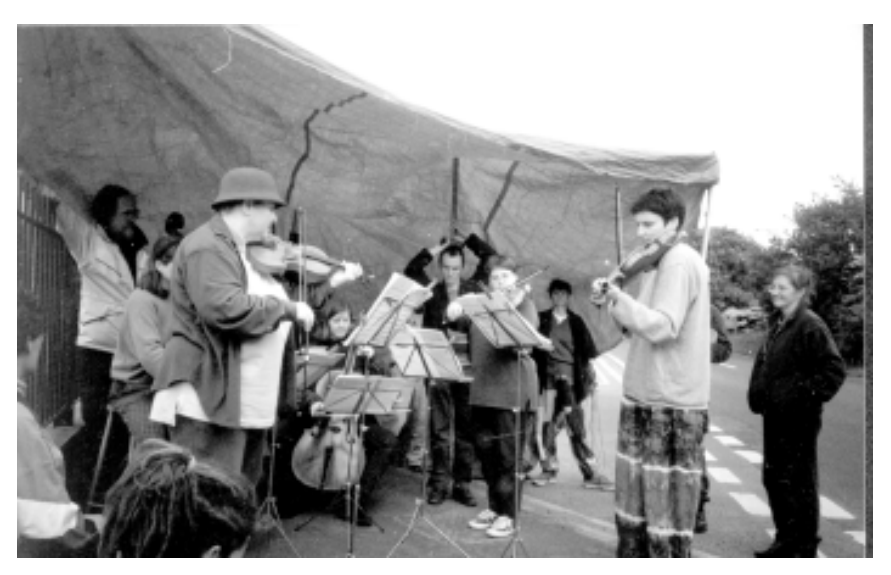
Sonnerie perform at Aldermaston, May 2000

threatens innocent civilians in their millions and presents a long-term and serious threat to the natural environment. What action is Thames Valley police taking on this urgent and desperately serious matter?" Although TVP had been in touch with Strathclyde to gain from their experience of dealing with our activities they opted for intimidation, but they relaxed into a more reasonable line when their bluff was called. This extended to an understanding that we would use the informal camping site we had intended. There was also a letter from AWE plc threatening legal action against the campaign should there be any disruption or damage.