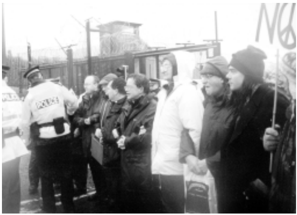
Scottish church ministers about to be nicked at Faslane, 14th February 2000

The weather deserves a special mention. When some of the cases came to court on October 2000 a police witness, asked if he had his notes from that day, said