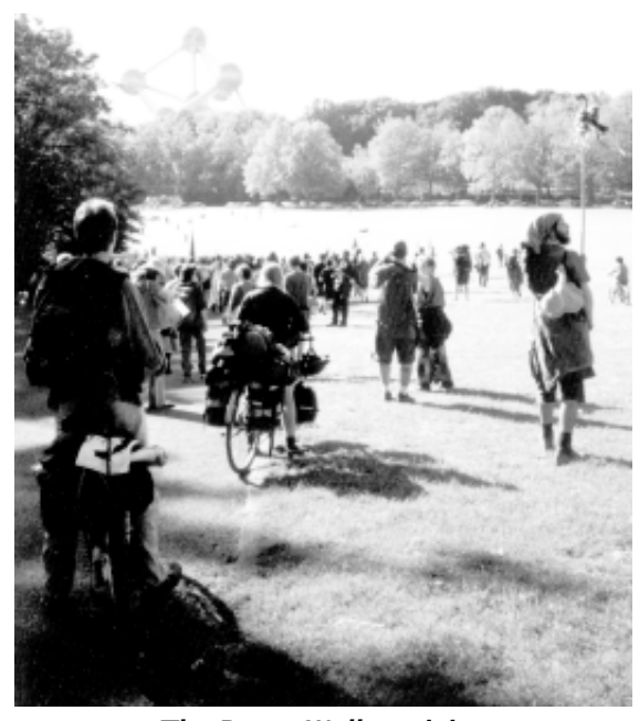
The Peace Walk arriving in Brussels, May 1999

market; the exploitation of children; unbridled militarism; the all-prevailing violence of society; third world debt. It was to her an amazingly liberating experience. We are pretty sure that it was our press release just after 9 p.m. that eventually alerted the security people to the fact that they had a problem "up the Goil". As darkness fell the plaintive words of the bargemaster rang out across the water: "What have they done to all my stuff?" Refusing to accept that they had done anything wrong the three women were remanded to Cornton Vale. With the honourable exception of the Big Issue in Scotland the press did virtually nothing with this splendid story, claiming that they were worried about being in hot water for dealing with matters that were sub judice . This was hardly the real reason since the media, even in Scotland, where the courts are more strict on this issue, regularly go near the edge and tell as much of the current story as they can. In the week that I write this story BBC Scotland has shown many times a film clip of football manager Jim McLean getting ready to assault an interviewer when they well know that the matter is before the Procurator Fiscal.