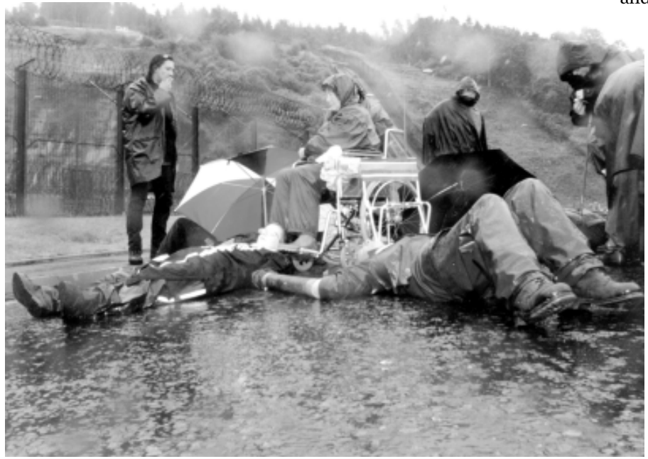
Coulport Weather - blockade at the main gate, August 1998

energy. The vegan food, provided in the first week by Bumblebee, was well received and campers overall felt that information was clear and helpful. On the down side, the chemical toilets were unpopular and the task groups needed more attention. Legal support was improved as the camp went on and we established what was to be our future pattern. We would provide 24 hour centralised legal support during camps and other direct action events and proactive communication with custody centres. Media coverage of our exploits was poor in the UK but much better abroad. In our 'safe house' media office in Cove. stories were being sent out in Dutch, French, Flemish, Swedish, Finnish and Danish, to Eire and the US, to Australia and Japan. It was a great thrill to see the