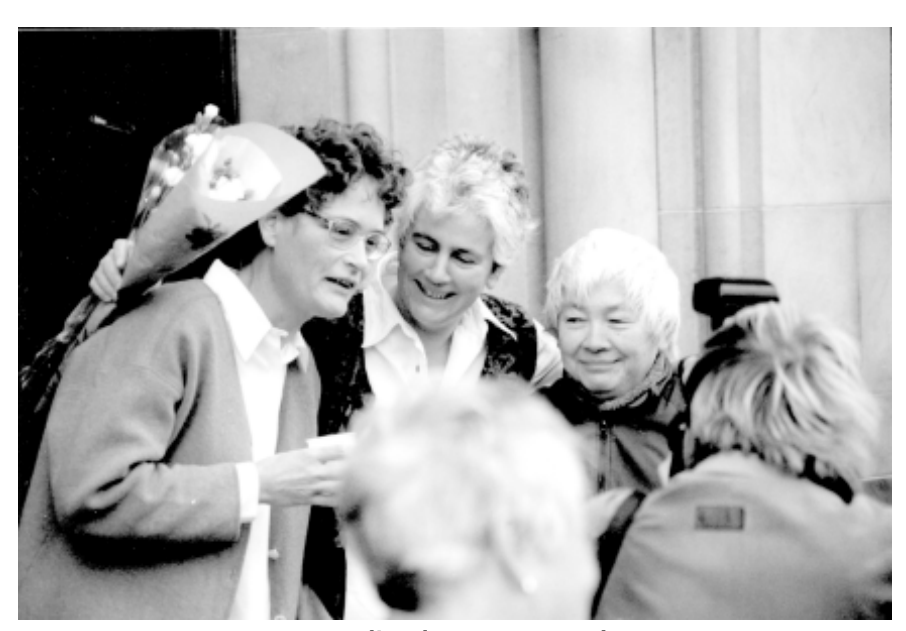
Verdict day at Greenock

indictment. The highlight of the Crown case was the MOD video of the bottom of Loch Goil. The film showed the entirely predictable image of computers on their sides in the silt as the small fish flashed round them. One monitor had an orange starfish draped to order on the corner.